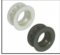
Pulley Shapes :