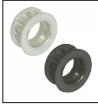
Pulley Shapes :