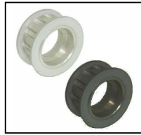
Pulley Shapes :