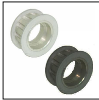
Pulley Shapes :