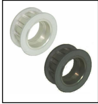
Pulley Shapes :